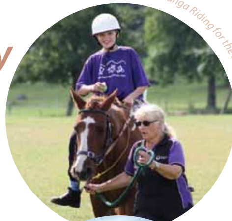
Otorohanga Riding for the Disabled