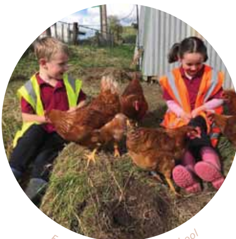
Eggonomics with Matiere School

"Without the support of KCE, small groups like us who perform lifesaving services would find things much harder. The help they give goes a long way to helping out the community."