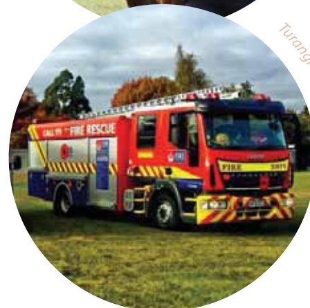
Turangi Volunteer Fire Brigade